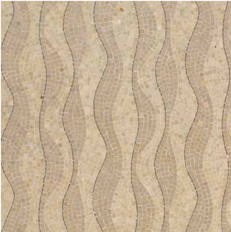
Gaudi Field Gold