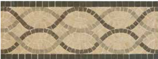
Ambient Border Gold 5 1/2" x 15"