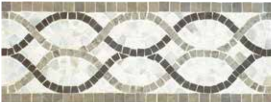
Ambient Border White 5 1/2" x 15"