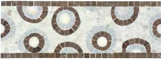
Jackie O Border Sky 5 3/4" x 16 1/2"