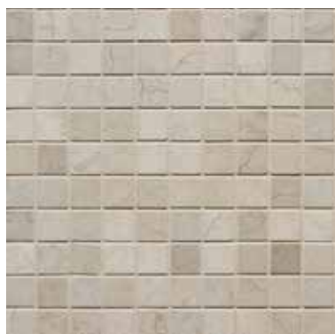
Mosaic Field 1" \times 1"