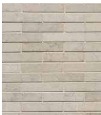
Long Brick Field \frac{3}{4}" \times 3 \frac{3}{4}"