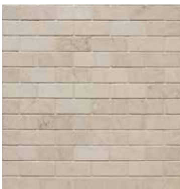
Small Brick Field \frac{3}{4}" \times 2"

Paradigm reimagines the ancient art form of mosaic with a decidedly modern sensibility. These eclectic patterns and moldings are prepared with the exacting precision, clean lines and impeccable finishing one expects from Italian craftsmanship. Whether you aspire to the cool minimalism of a Manhattan loft or the playful modernism of a Palm Springs hideaway, Paradigm's breadth of color, shape and design will bring your vision to life.