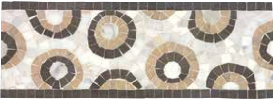
Jackie O Border White 5 3/4" x 16 1/2"