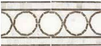
Optic Border Chocolate 4 1/4" x 9 1/2"