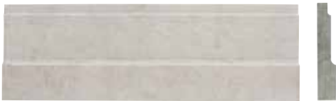
Bauhaus Base 4" x 12"