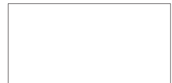
24" x 48" x 3/8" Polished