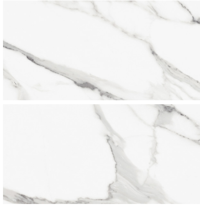
Polished - 11 13/16" x 24" x 3/8"