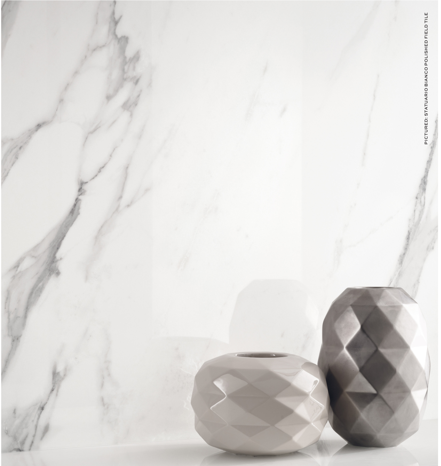
PICTURED: STATUARIO BIANCO POLISHED FIELD TILE

The Marmi Italia Collection presents the look and feel of classic Italian marbles in a variety of porcelain styles, perfect for high traffic areas. Statuario Bianco is a timeless classic featuring subtle grey veining on a white background in a large format 12" x 24" tile. The Bastoni pattern is a uniquely beautiful re-imagination of thin linear mosaics, conveyed upon a large format 24" x 48" tile. Marmi Italia Statuario Bianco captures in porcelain the dramatic features of this Italian classic as never before.