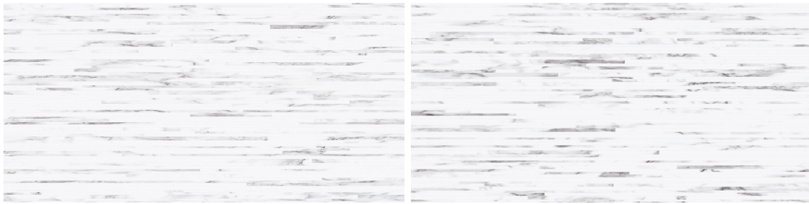
Polished - 24" x 48" x 3/8"