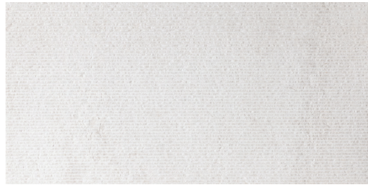
Raked White Sand