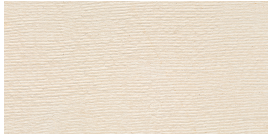
Raked Jerusalem Pearl