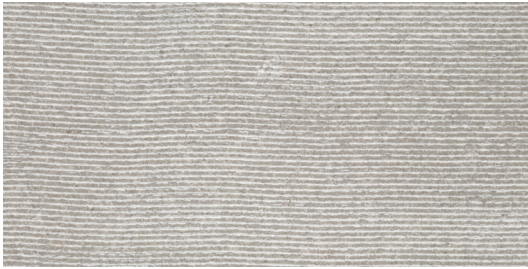
Cinder Grey Raked